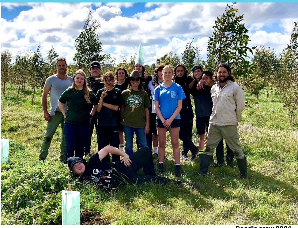
Boodja crew 2021

Industry-based workshops included presentations from Government, nongovernment organisations and volunteers, that included topics such as careers in Ranger